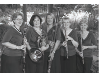
CLASSIC WINDS WOODWIND QUINTET